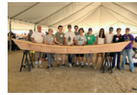
Solar Cup Competition