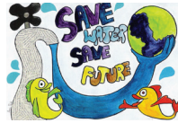
Water Is Life Student Art Contest