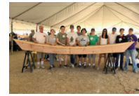
Solar Cup Competition