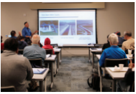
Water Education Classes

Educating and engaging the West Basin community about local, regional and global water issues is an important part of the District's mission of continued water reliability. The District provides the following free outreach and education programs for residents in its service area.