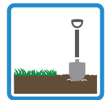
Free public workshops