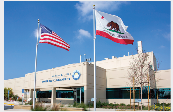
West Basin's Edward C. Little Water Recycling Facility