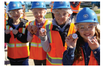
School Field Trips