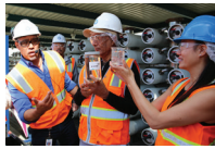
Public Facility Tours