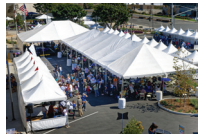
Water Harvest Festival