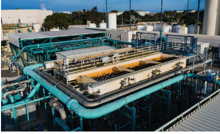
Microfiltration at ECLWRF

Recycled water is the cornerstone of West Basin's efforts to increase local water reliability. The District produces and delivers five types of customer-specific recycled water for the following purposes: